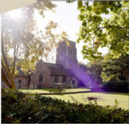
Supported by St Faith's Church